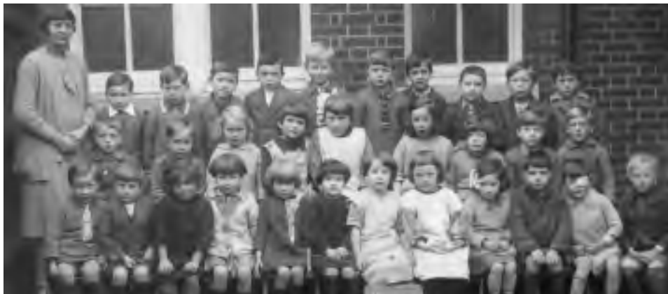
Times past: school picture from 1928